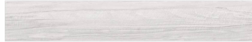
Historic Wash Grey