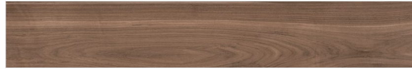
Wonder Tree Bark