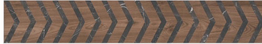
Wonder Tree Bark Decor