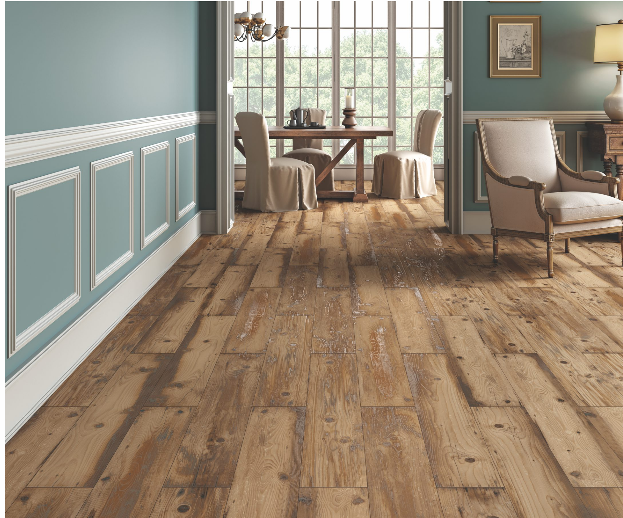
FLOOR : Vintage Camel | Size - 195x1200mm | Finish - Rustic Carving