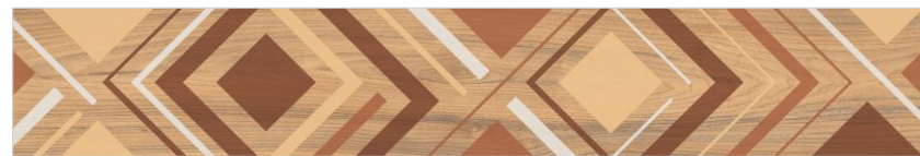
Vibes Camel Decor