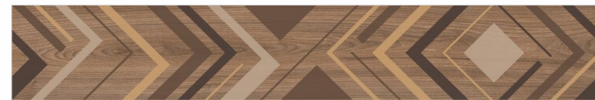
Vibes Brown Decor