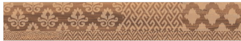
Historic Camel Decor