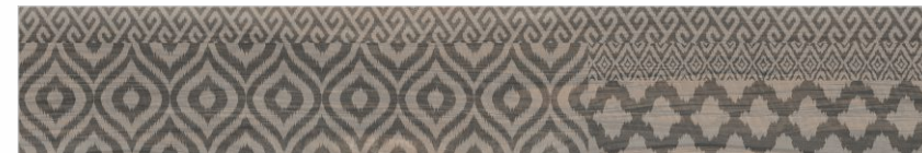
Historic Verde Decor