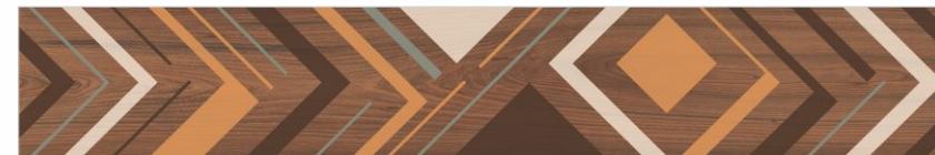
Vibes Ochre Decor