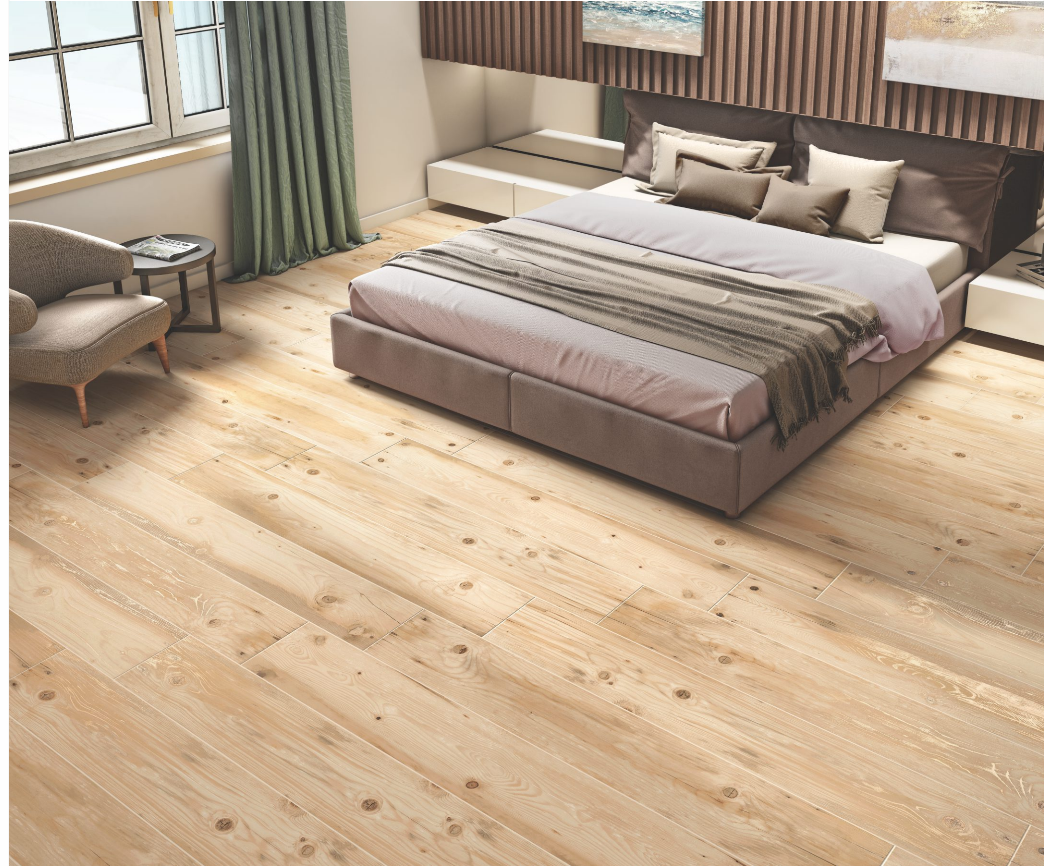
FLOOR : Vintage Crema | Size - 195x1200mm | Finish - Rustic Carving