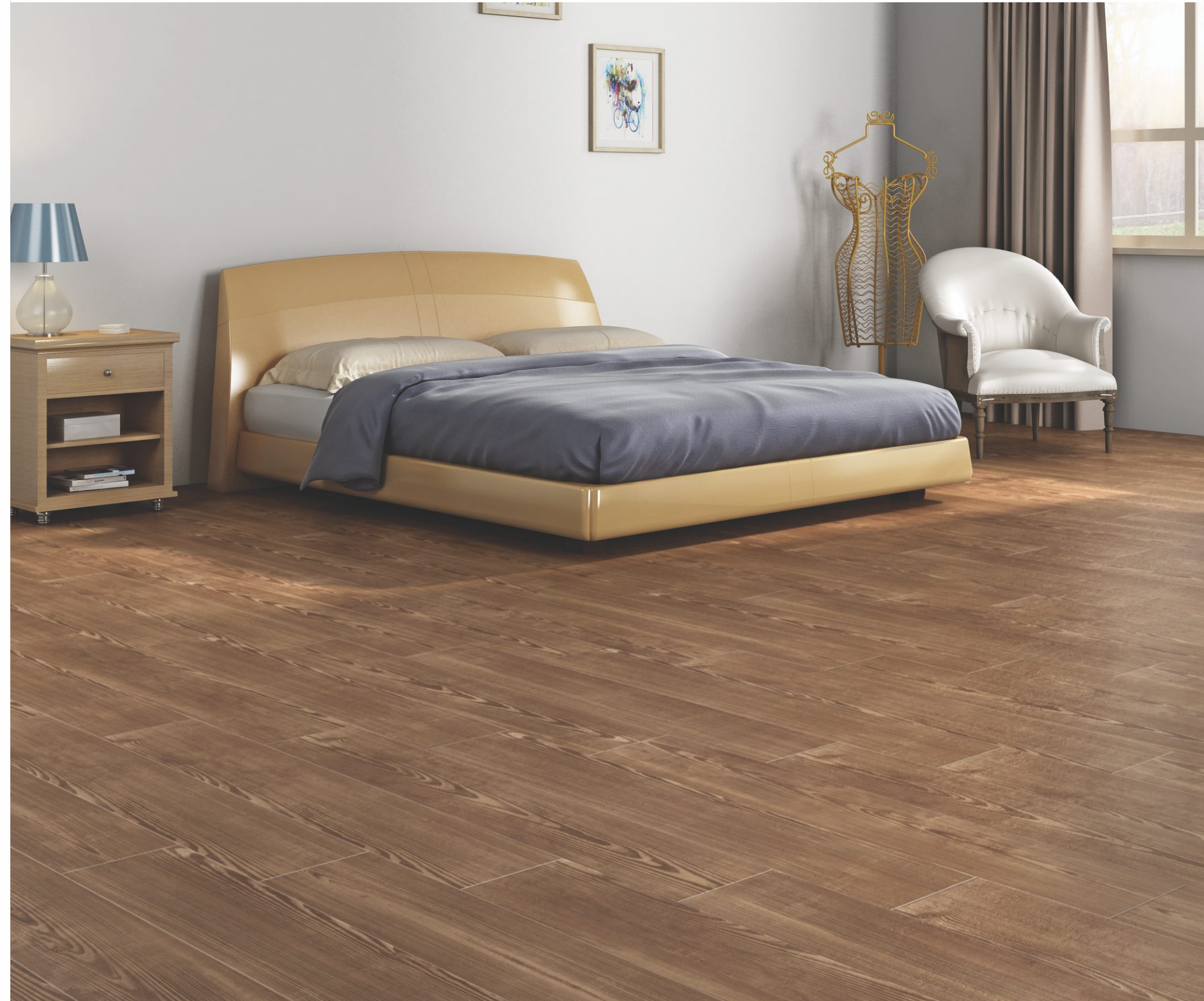
FLOOR : Pinewood Ochre | Size - 195x1200mm | Finish - Rustic Matt